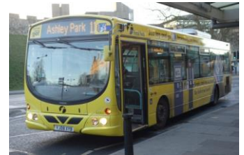
Single decker advertising the All York bus ticket

Send your views to the Parish Council (see below).