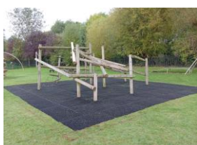
Newly laid rubber safety surface

Thank you to all our residents for supporting HWPC and letting us know how much you appreciate the time and effort HWPC put into maintaining the park for everyone to enjoy. To celebrate this we are delighted to announce that Stray Road Play area and fields has now applied for the Community Green Flag Award! https://www.greenflagaward.org/how-it-works/judging-criteria/green-flag-community-award/