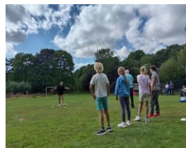
Enjoying Ignite Sports Day