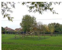
After one week of grass growth!